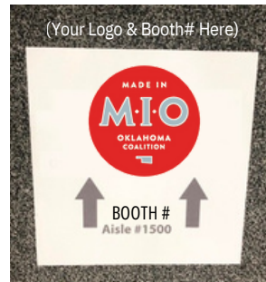
Vinyl Floor Graphic